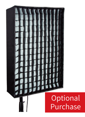
Eggcrate diffuser box Model # LA-BS100 for SL-100P Model # LA-BS150 for SL-150P