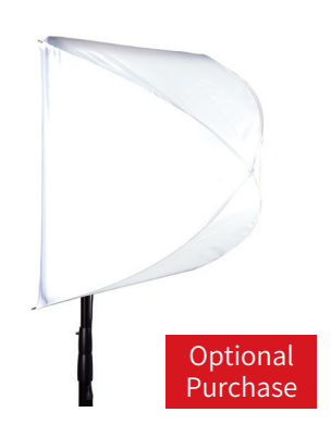
Ball diffuser Model # LA-DS100 for SL-100P Model # LA-DS150 for SL-150P